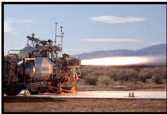
Rocket Testing at the Mojave Air & Space Port

The propellant mixture in each solid rocket booster consists of ammonium perchlorate (oxidizer), aluminum (fuel), iron oxide (catalyst), and polymer (binder that holds the mixture together) and an epoxy during agent. When the propellant is ignited, the emissions contain simple products like aluminum oxide (a simple abrasive) and ammonia (a hazardous air pollutant that is harmful to the lungs when breathed). The good thing is, most of the booster emissions occur in the upper atmosphere and not at ground level (air districts are primarily concerned with ground level emissions – less than 3000-feet). However, before the booster rockets are used for lift-off, each rocket is designed and tested to assure its consistent operation. These rocket tests are done at ground level.